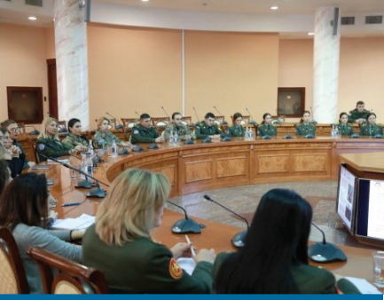
Discussion dedicated to the summing up of the events of the 2019 program of the UN Population Fund Cooperation Program

especially in peacekeeping missions. It is noteworthy that compared to 2018, the number of female servicemen in the peacekeeping brigade in 2019 increased by about 8%, and the number of those enlisted in AF subdivisions involved in the UN and NATO peacekeeping operations - by about 60%. Currently, the women's peacekeeping troop are part of the Armenian peacekeeping force in the NATO "Kosovo Forces" (Kosovo, KFOR) and "Resolute Support" peacekeeping missions (Islamic Republic of Afghanistan) as well as the UNIFL (United Nations Interim Force) in Lebanon carried out under the auspices of United Nations. Ministry of Defense also held public events, round table discussions, etc.