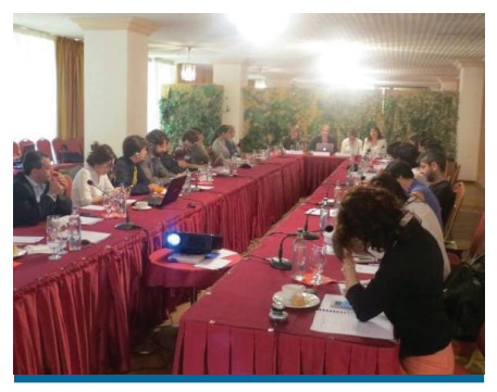
Presentation of the 2013 Monitoring Report of the Civil Society on UNSCR 1325