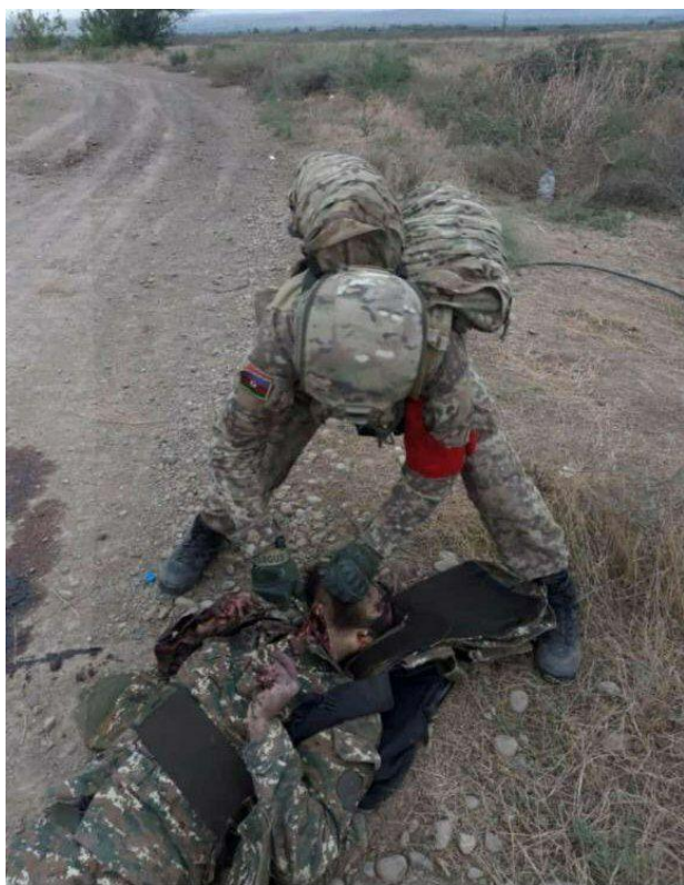
Figure 29. A Photo of Beheading and Mutilation of an Armenian Combatant's Body by an Azerbaijani Combatant 12

There is clear information from both open and closed sources that a certain number of military servicemen of the Republic of Artsakh or the bodies thereof are under the control of the Azerbaijani armed forces. Some Azerbaijani media and social media representatives have already spread some videos and photos showing some possible crimes against Artsakh combatants. Taking into account those preliminary proofs and the large number of examples of the 2016 April war, the likelihood is very high that the Artsakh military servicemen and/or their bodies might be extensively abused by the Azerbaijani armed forces again.