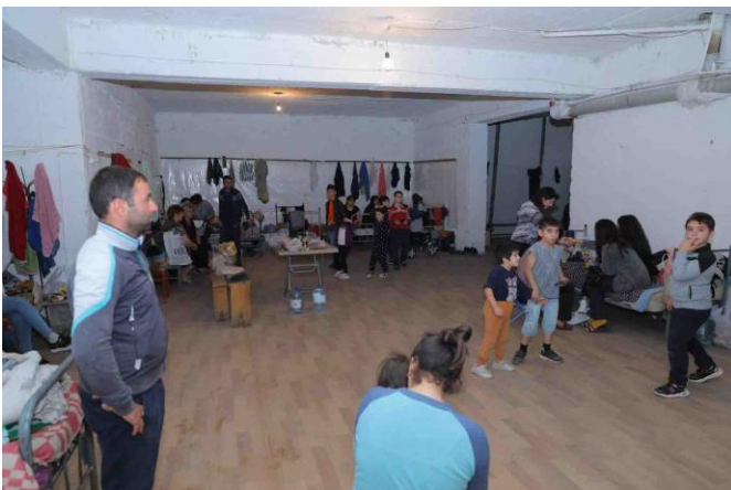
Figure 12. One of the Shelters for Civilians in Stepanakert City

As a result of the Azerbaijani hostilities and indiscriminate, targeted and systematic strikes against civilian objects, approximately 60% (over 90,000) of the entire population of the Republic of Artsakh have fled their homes to shelter at safer places. Some of them have moved to other settlements of the country and others moved to the Republic of Armenia. The overwhelming majority of the current population has to live at shelters to avoid Azerbaijani indiscriminate and targeted strikes. For that reason, tens of thousands of children, women, elderly, persons with disabilities and other vulnerable groups live not only with constant security threats and psychological terror, but also with certain deprivations of basic rights and conditions, such as food, healthcare, education etc. Those children who have stayed in the country are deprived of getting education, as the schools are closed because of the Azerbaijani attacks on the civilian areas. While those children who have left for the Republic of Armenia face natural difficulties with integration with their new environments and schools.