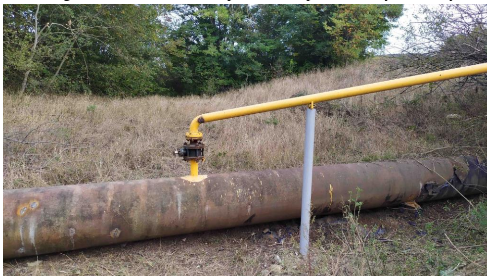
Figure 20. The Main Gas Pipeline in Stepanakert City Struck by Azerbaijan

For a few times the central and much more times local gas pipelines have been also targeted intentionally, as a result of which all the gas clients have been deprived of gas supplies, heating and hot water.