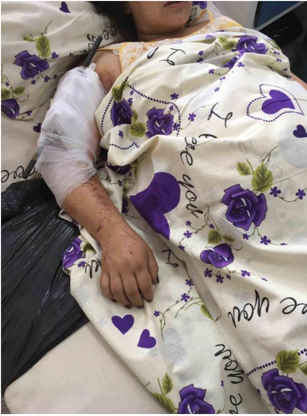
Figure 5. A Woman Injured by Azerbaijan in Martakert Town