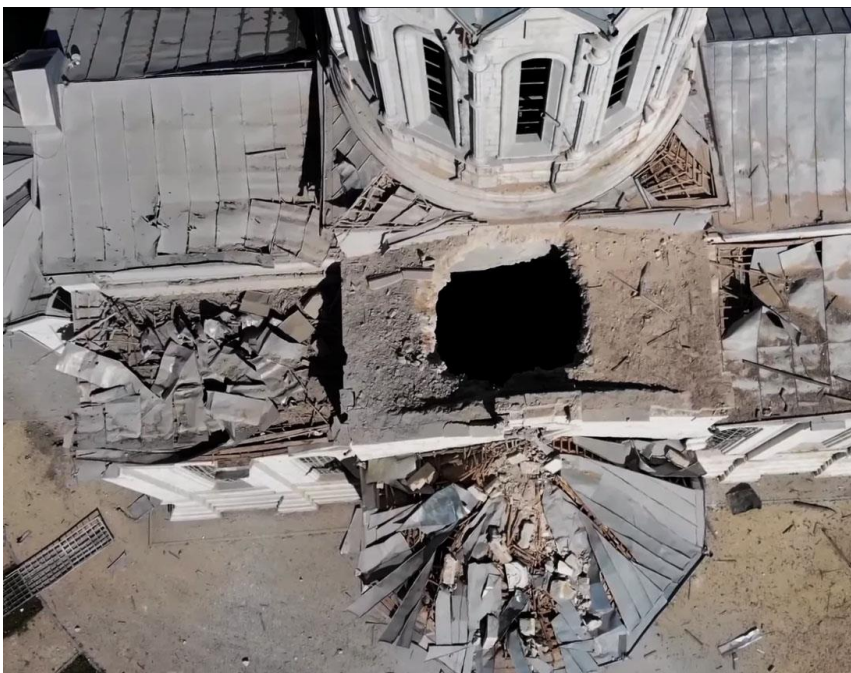
Figure 27. The Holy Savior Cathedral of Shushi After the First Strike by Azerbaijan (exterior)

On 8 October 2020, Azerbaijani armed forces launched two intentional assaults on Holy Savior Cathedral in the town of Shushi, which is the recognizable cultural and religious symbol of Artsakh. The analysis of that war crime demonstrates that it was fully intentional and targeted, because the Azerbaijani forces struck the cathedral for two times within a few hours with use of striking and manageable drones. This act of Azerbaijan is in line with its continuous practice of destroying Armenian cultural heritage of Artsakh. It also demonstrates radical disrespect towards Christian element of Armenian identity.