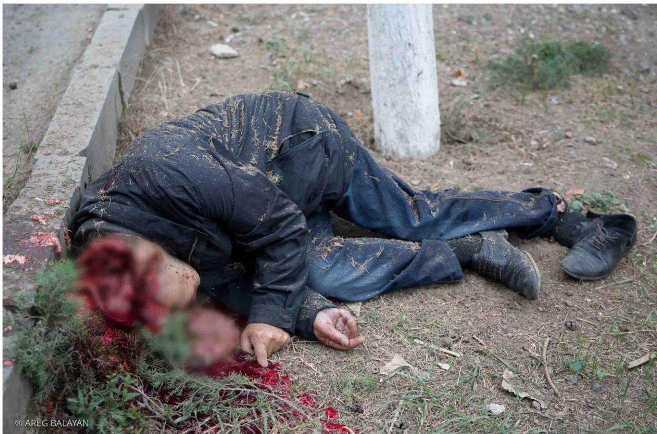
Figure 1. A Civilian Killed by Azerbaijan in Martuni Town

The Azerbaijani armed forces attacked more than 120 civilian settlements, including densely populated ones (capital Stepanakert, towns of Shushi, Hadrut, Martuni, Martakert, Askeran, Karvajar, Berdzor, villages of Taghaser, Vardashat, Spitakshen, Maghavirus, Nerkin Horatagh, Alashan, Mataghis, etc) with aerial, artillery, rocket and tank fire strikes, most of which were targeted or indiscriminate, killing and injuring civilians. In the cases of indiscriminate attacks, the Azerbaijani armed forces failed to abide by the obligation to distinguish between military targets and civilians, who may not be targeted for attack. Nor do they take feasible precautions to minimize harm to civilians. In many cases, attacking the civilians was targeted and intentional, since military targets were located very far from civilian objects, and the Azerbaijani forces used accurate armament like missiles and striking drones. The absence of military targets in the vicinity of attacks further confirms their deliberate nature, which amounts to a war crime.