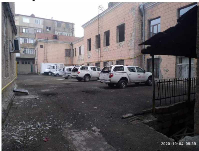
Figure 59. The Head Office of the Telecommunication Company Struck by Azerbaijan

For a few times the central and much more times local gas pipelines have been also targeted intentionally, as a result of which all the gas clients have been deprived of gas supplies, heating and hot water.