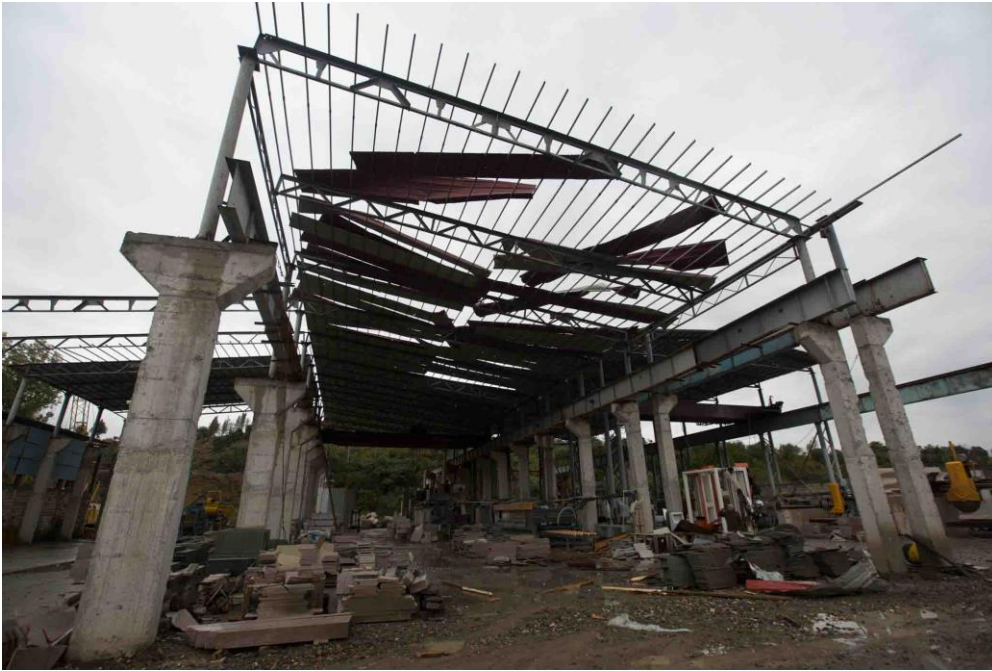
Figure 23. A Market in Stepanakert After Being Struck by Azerbaijan