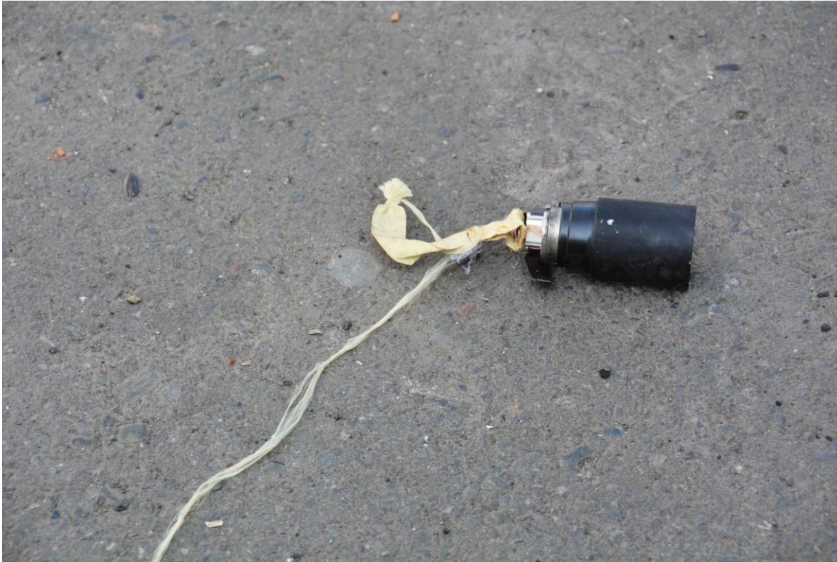
Figure 32. A Part of Azerbaijani Missile on a Residential building of Stepanakert City