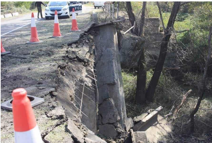
Figure 21. A Bridge in Berdzor after Being Struck by Azerbaijan

The Azerbaijani armed forces have deliberately targeted also industrial objects (factories, hydropower stations, agricultural objects, services etc). They directly destructed hundreds of such business activities, negatively affecting their productions, supplies and services.