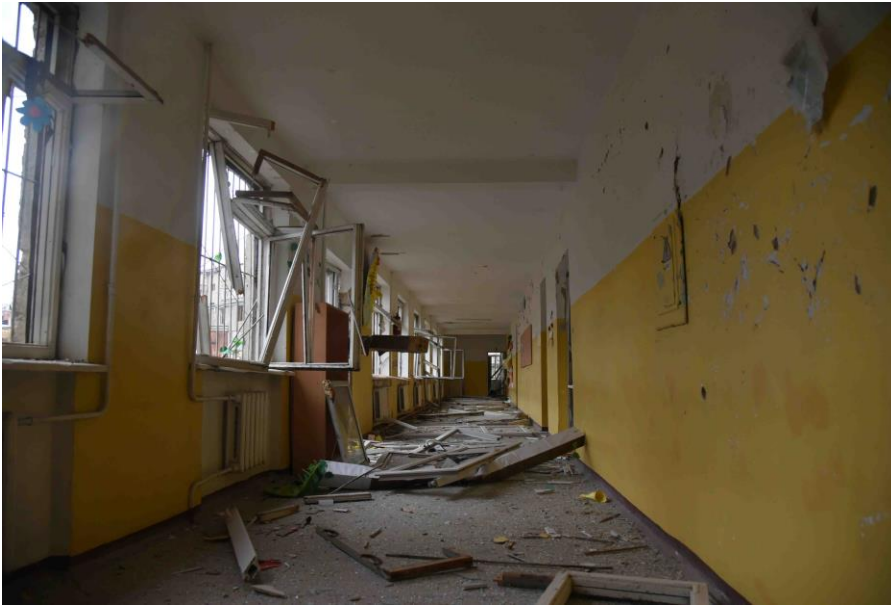
Figure 25. A damaged Kindergarten in Stepanakert City