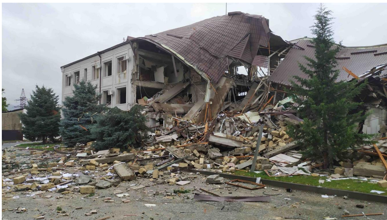
Figure 16. The Head Office of “Artsakh Energy” Company after Being Struck by Azerbaijan

The Azerbaijani armed forces have intentionally struck also several hydro-power stations in the depth of the country aiming at destructing the electricity production system, too.